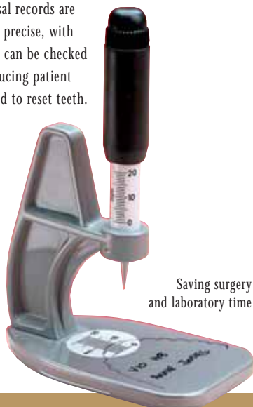
Saving surgery and laboratory time

This straightforward procedure ensures a set-up that will require fewer adjustments, saving not only time, but also resulting in greater patient satisfaction.