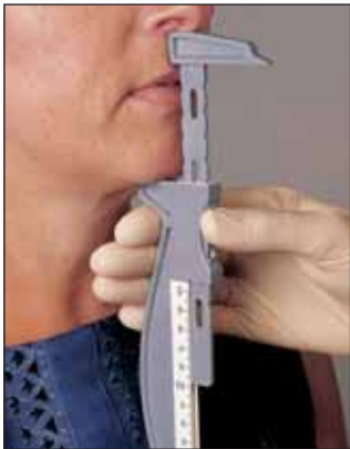
Autoclavable and simple to use

When the Schottlander Autoclavable Bite Gauge is used in conjunction with the Schottlander Alma Gauge and the Schottlander Autoclavable Bite Plane a predictable result can be achieved. The Schottlander Autoclavable Bite Gauge allows the freeway space to be determined in two ways. The upper arm of the Schottlander Autoclavable Bite Gauge can be removed and turned around depending on which method is preferred.