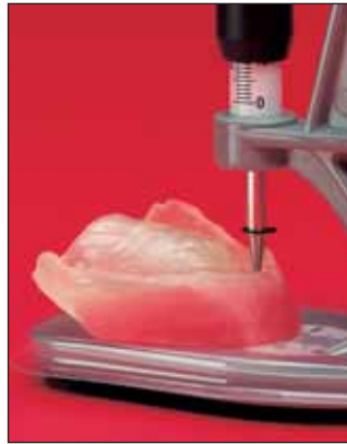
Checking the occlusal rim