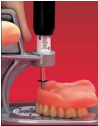
Assessing the existing denture

The Schottlander Alma Gauge not only helps in the provision of better dentures but also saves you time. Simply use the Alma Gauge to take horizontal and vertical readings of the existing denture referenced to the patients incisive papilla.